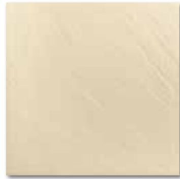
DAR44313 PEI 5 ○ 80 / m 2 mat | matt