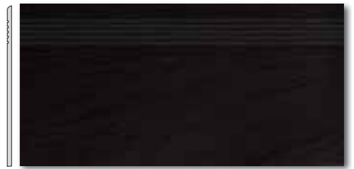
DCPSE314 PEI 5 ○ 72 / ks mat | matt | R10 | A