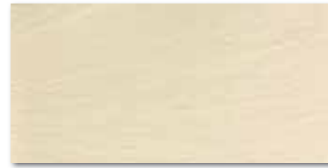
DARSE313 PEI 5 ○ 80 / m 2 mat | matt