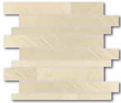
DDP44313 (SET) PEI 5 ○ 72 / set mat | matt | R10 | B | >