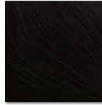
DAR44314 PEI 5 ○ 80 / m 2 mat | matt