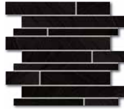
DDP44314 (SET) PEI 5 ○ 72 / set mat | matt | R10 | B | >