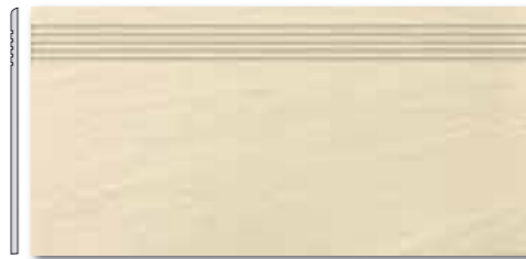
DCPSE313 PEI 5 ○ 72 / ks mat | matt | R10 | A