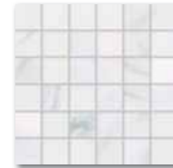
WDM05018 68 / set lesk | glossy