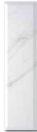
WARSU018 58 / ks lesk | glossy