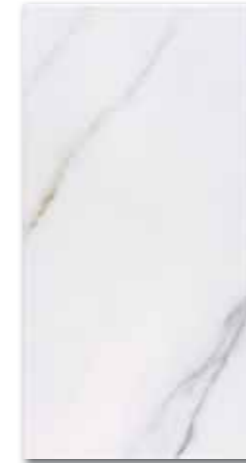
WADV4018 82 / m 2 lesk | glossy