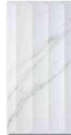
WARV4018 88 / m 2 lesk | glossy