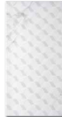
WITV4018 78 / ks lesk | glossy